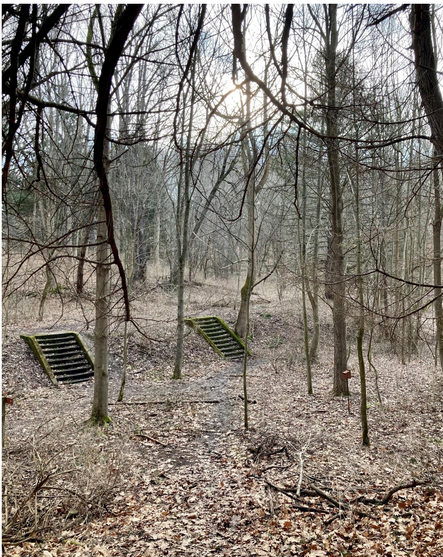
Concrete steps in the Lost City of Tryon.

I envision a community of early settlers at Tryon busily constructing buildings and the necessarily tools and materials. I see and hear blacksmiths forging steel into tools, carpenters hammering nails, and everyone in the community contributing some skill to build this new city. The beginning and end of the piece represent this idea – the building of the City of Tryon. Foot-stomps from the ensemble help evoke this scene. The lyrical middle section represents the beauty of the land, its verdant hills situated beside a creek.